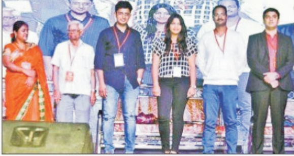
ఈవెంట్ లో పాల్గొన్న ముఖ్య అతిథులు