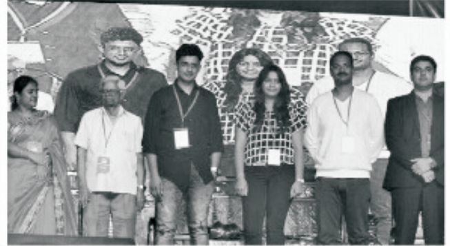
కార్యక్రమంలో పాల్గొన్న అతిథులు